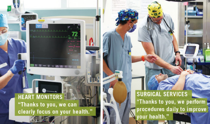
HEART MONITORS "Thanks to you, we can clearly focus on your health."