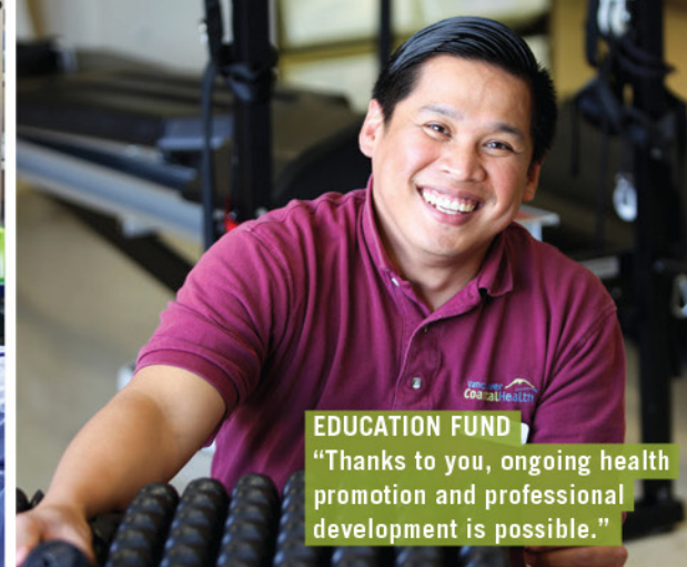
EDUCATION FUND "Thanks to you, ongoing health promotion and professional development is possible."