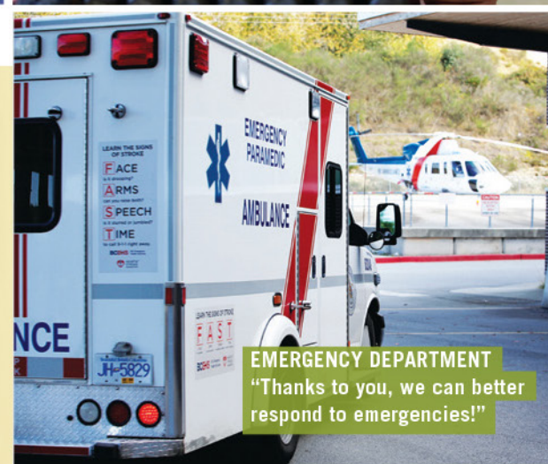
EMERGENCY DEPARTMENT "Thanks to you, we can better respond to emergencies!"