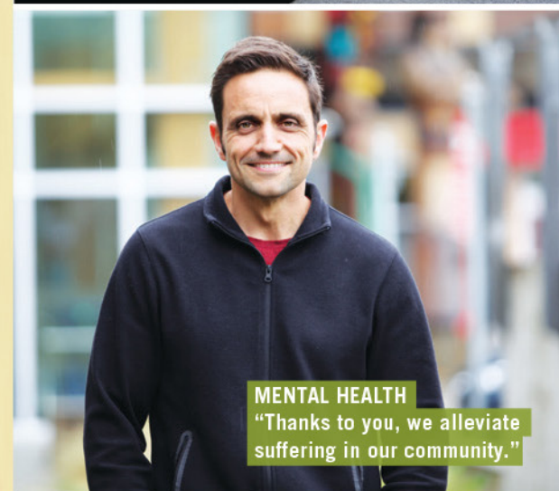
MENTAL HEALTH "Thanks to you, we alleviate suffering in our community."