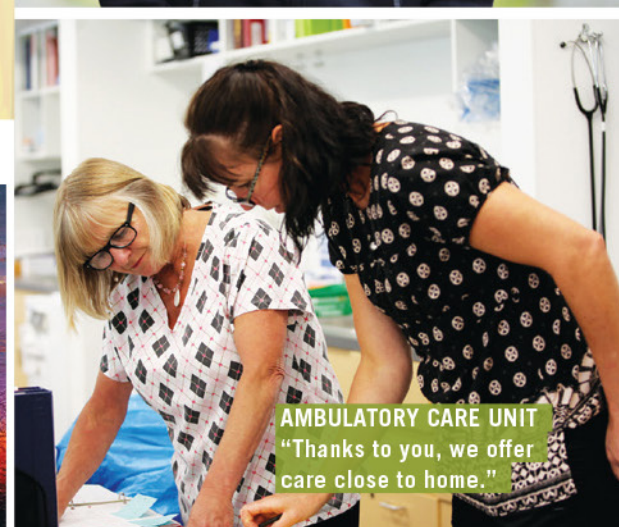
AMBULATORY CARE UNIT "Thanks to you, we offer care close to home."