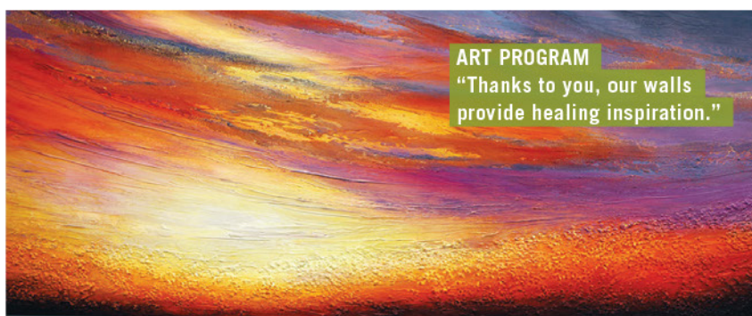
ART PROGRAM "Thanks to you, our walls provide healing inspiration."